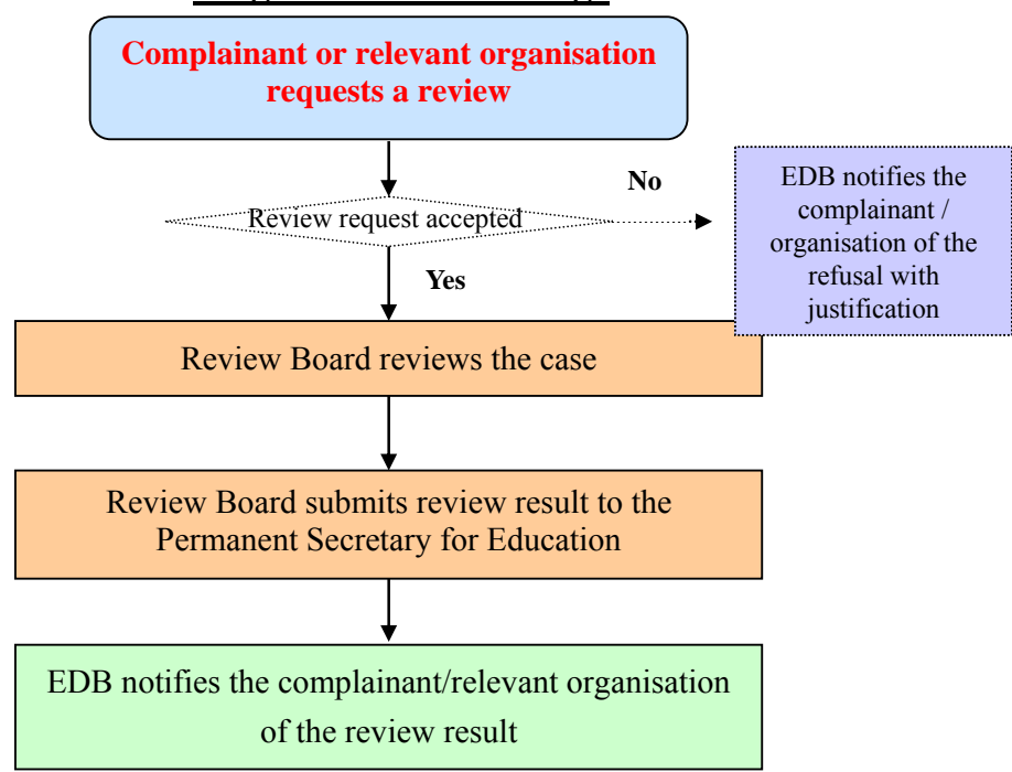
Diagram 2: Review Stage

5.2 A case will not be reviewed unless it has undergone the investigation and appeal stages of handling by the school/EDB. Before requesting a review, the complainant should state explicitly the reasons for his/her discontent (e.g. the case has not been handled according to proper procedures or the investigation result is prejudiced) and provide new or substantial supporting evidence. Otherwise, the Review Board may refuse the request for review. Please see <u>Diagram 2</u> for the review procedures.